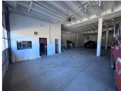
Restrooms (SE corner)