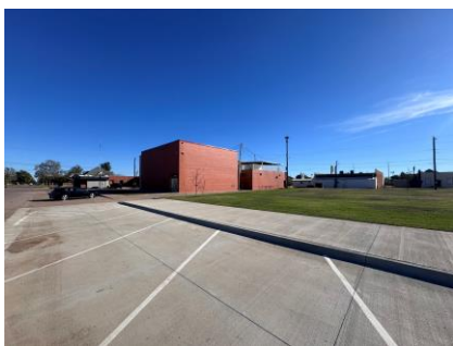
View from Northwest