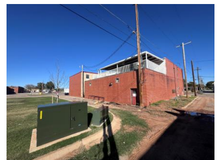
View from Southwest