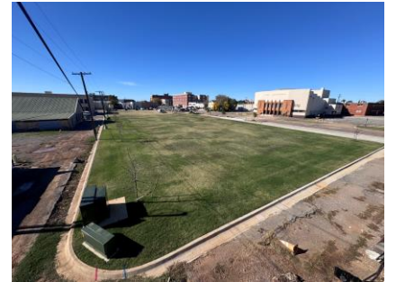
City Park View From Roof