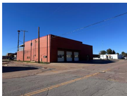
View from Southeast