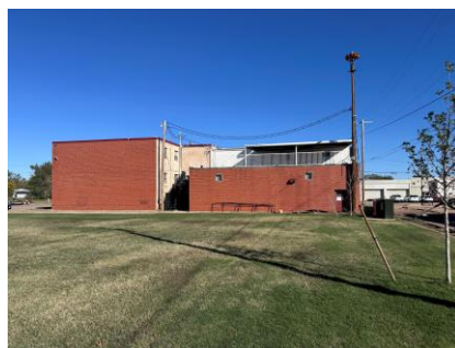
View from Northeast