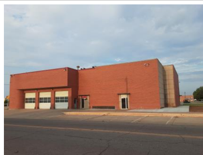
View from Northeast