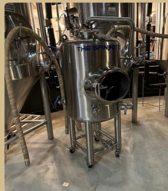
Spinbot 5,000 Infuser Qty 1