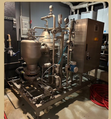
Centrifuge - Year 2015 Model # GSC40-06-077 Qty 1