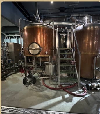
Vessel Brewhouse Qty 2