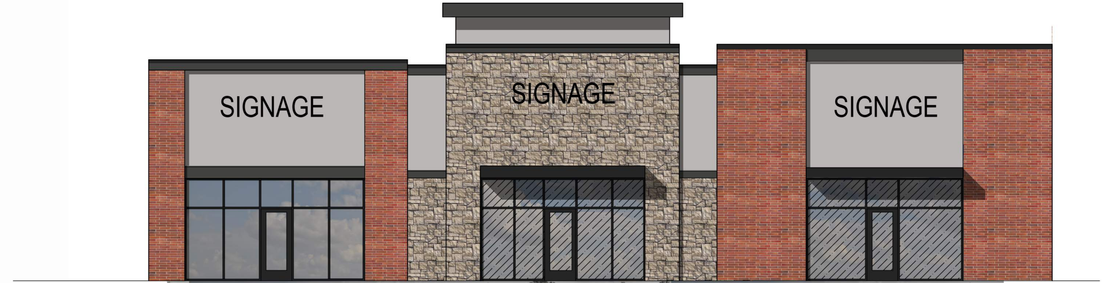
NORTH ELEVATION ④ SCALE: 3/16" = 1'-0"