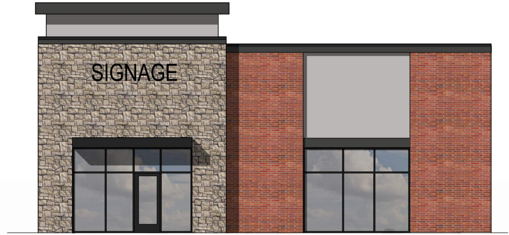
EAST ELEVATION ② SCALE: 1/4" = 1'-0"