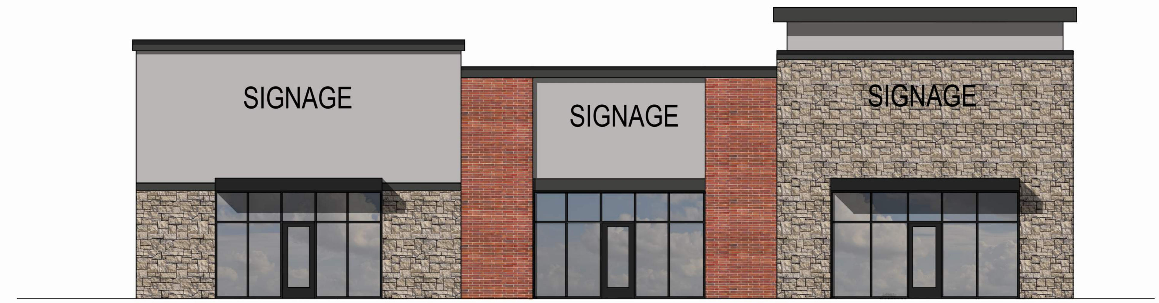
SOUTH ELEVATION ① SCALE: 1/4" = 1'-0"