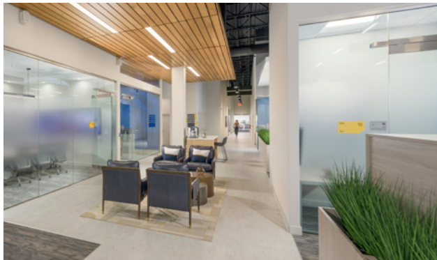
Above: Flex/R&D interior office build-out Below: Flex/R&D Warehouse/lab build-out