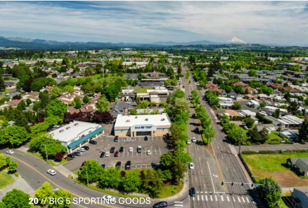
20 // BIG 5 SPORTING GOODS