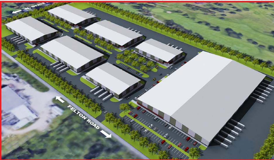
*Rendering depicts potential development of 20.5-acre site